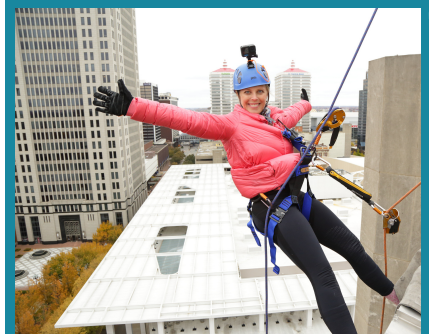
OVER THE EDGE FUNDRAISER