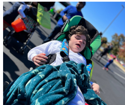
Trunk or Treat Event

“Critically Loved exists to provide guidance and hope for families of chronically or critically ill children.”