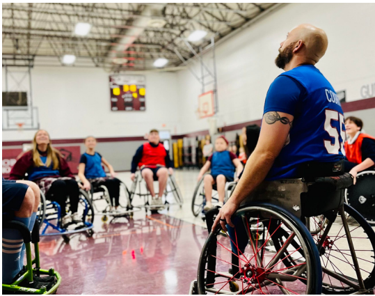
Inclusion Education at Our Savior Lutheran School